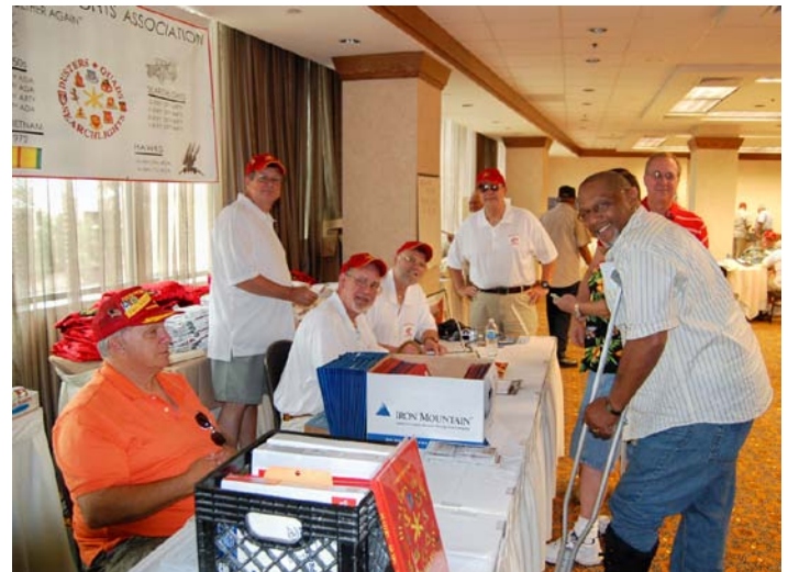
Registrations and memorabilia setup

distinctive unit signages were memorabilia displays, NDQSA merchandise sales, and donated items of a Chinese auction. No wonder the hospitality room was the principal hangout for fellowship around circular tables. Refreshments (cokes, beer, and edibles) were provided throughout the gathering to any and all that cared to imbibe with donations covering all their costs.