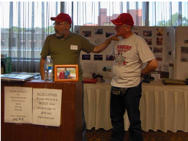
NDQSA Official Book Release Party