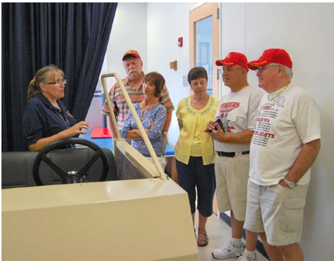
Brooke Army Medical Center Wounded Warrior donations delivery

On Friday morning July 3rd, three buses equally full of conventioners stopped at the Vietnam Memorial and then toured the grounds of Mission San Jose. On the way back to the hotel, shoppers were let off at the Old Market to buy souvenirs and eat some of the best Tex-Mex food in America. No wonder the afternoons were spent back at the cool hotel observing siesta time and attending book signing parties, line dancing classes, or discussing Association business when needed.