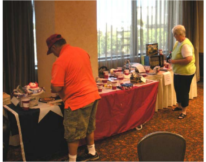
Chinese auction of homemade craft items and souvenirs raised $1000