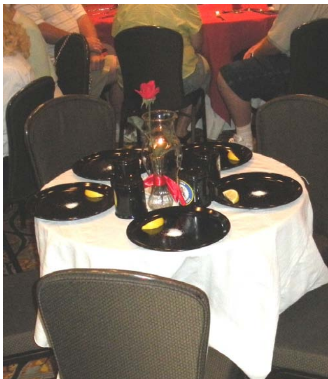
Remembrance Ceremony Table at San Antonio