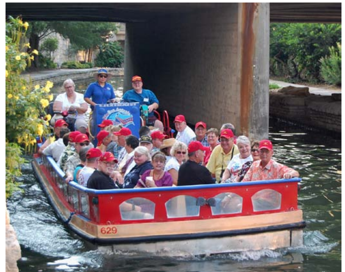
River Barge Tour

City sightseeing began on Wednesday evening when three floating barges full of revelers explored the famous tourist attractions on the San Antonio Riverwalk. The reunion director cautioned the nautical explorers to watch out for German U-boats and pirate ships. Everyone returned safely and dry after noting where the many popular restaurants and clubs were open for business with good dining and entertainment.