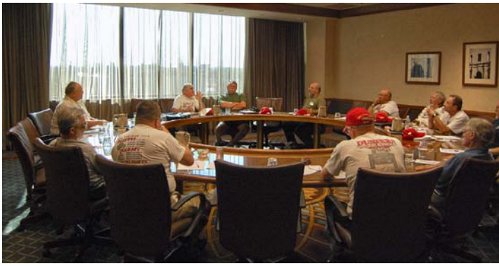
Thurs. July 2: Executive Committee Meeting

On Thursday AM, after the Exec. Comm. Meeting, two buses totally full of camera toting passengers went to the Alamo, Ft. Sam Houston and Brooke Army Medical Center, and the artisan shops in La Villita.