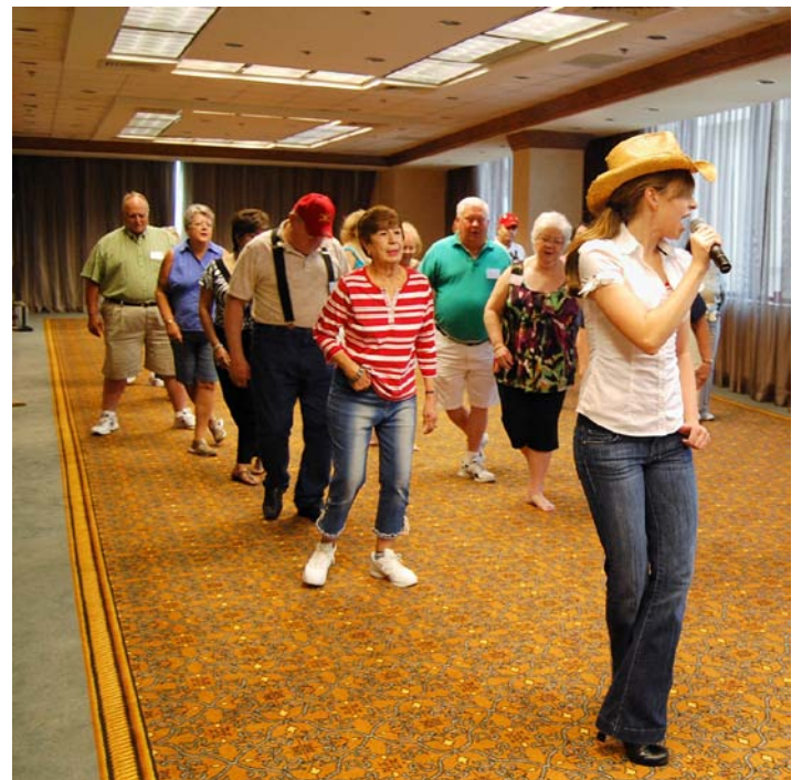
Line Dancing Class for family members