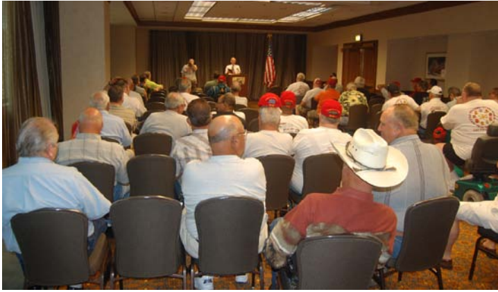
Annual Business Meeting Election of Officers, By-Laws approved and enacted