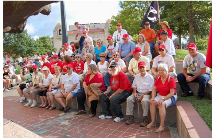
Vietnam Memorial Service

On Thursday AM, after the Exec. Comm. Meeting, two buses totally full of camera toting passengers went to the Alamo, Ft. Sam Houston and Brooke Army Medical Center, and the artisan shops in La Villita.